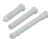
5", 7", 10" diffuser tubes