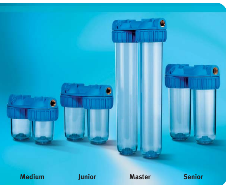
Medium Junior Master Senior