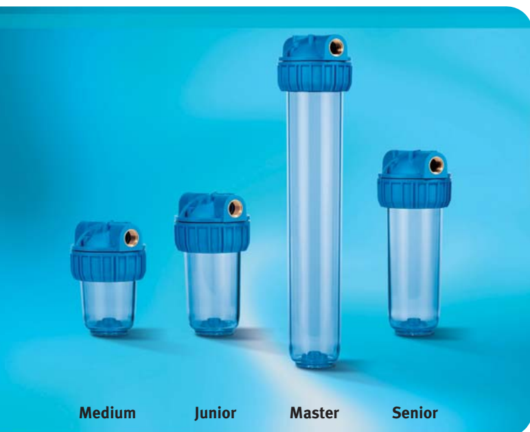
Medium Junior Master Senior